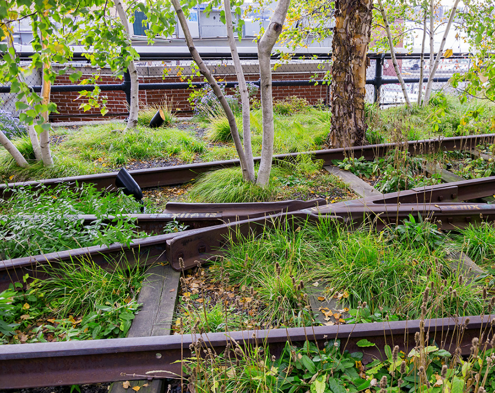
Image: Highline, NYC